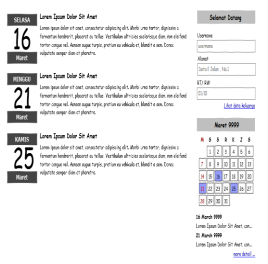
Fig 2. Design of a Citizen Data Collection System.