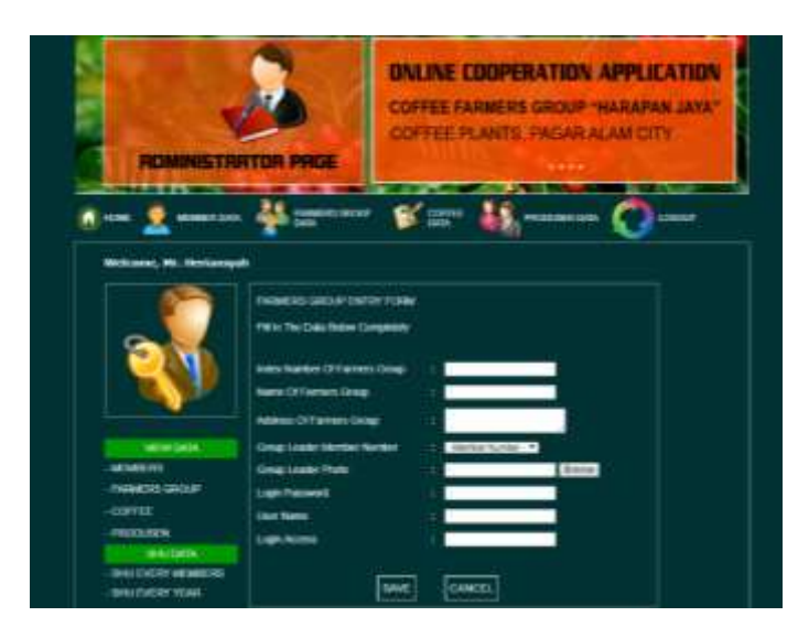
Figure 6. Membership entry page for administrators

Admin page The Cooperative Member Entry found in Figure 6 above is an entry page that can be used by admin to add new cooperative members.